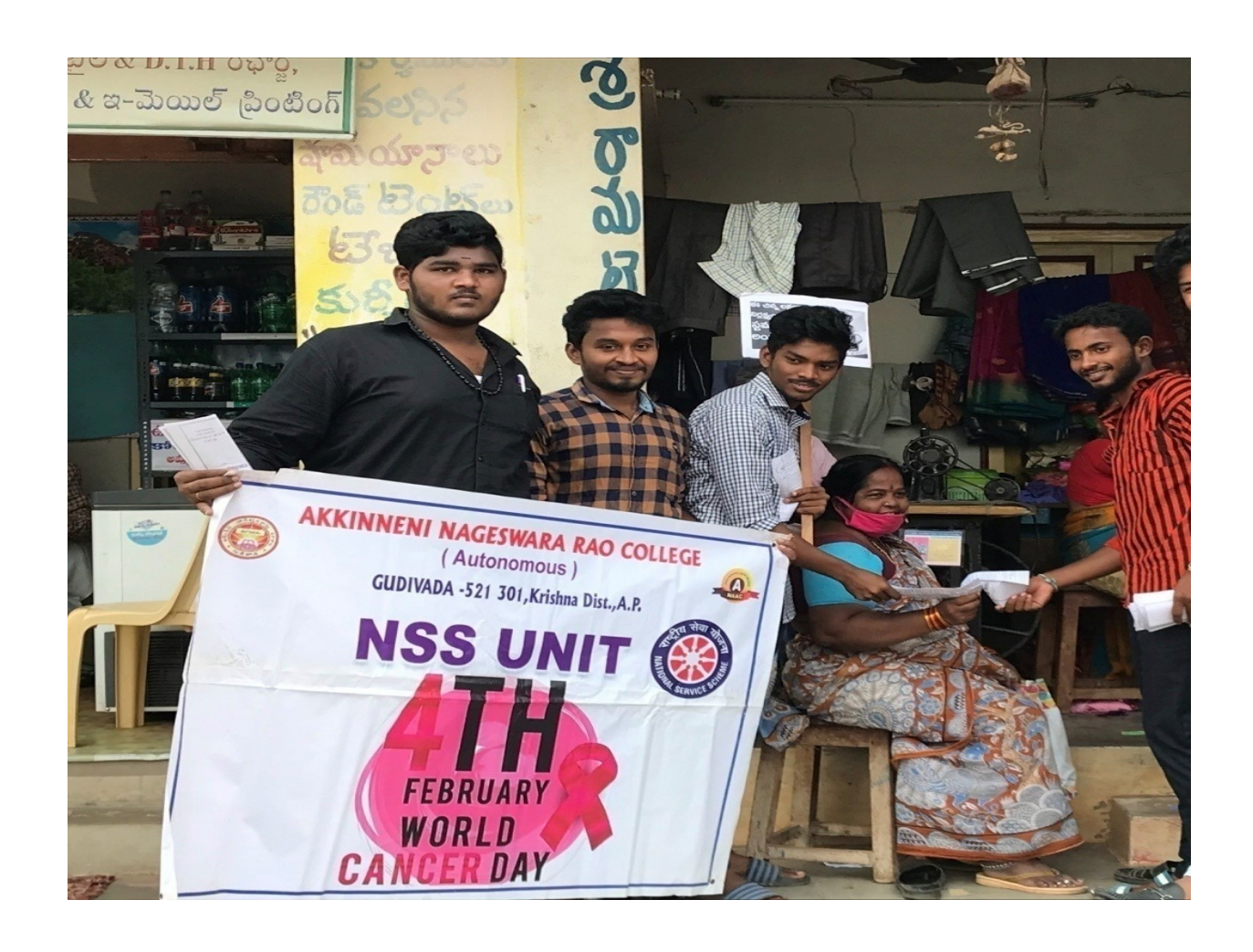
Our NSS volunteers creating awareness on cancer in association with Women Development Cell and NSS Units