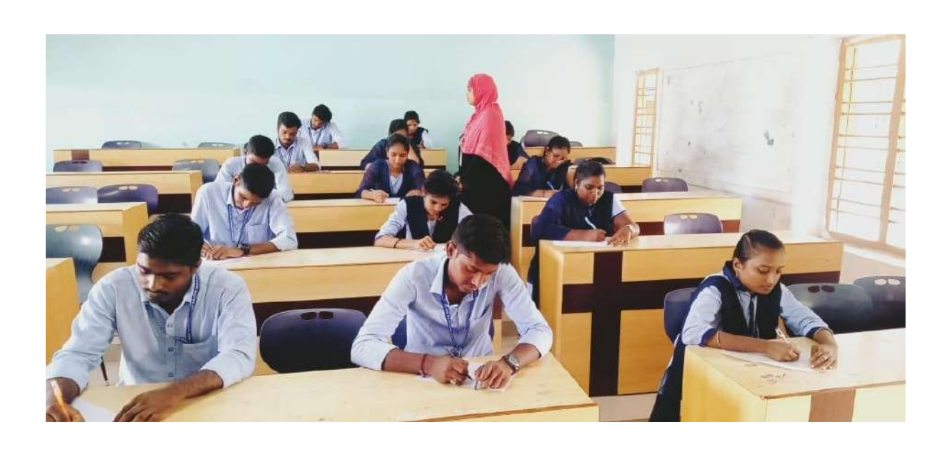
Conducting easy writing competition on language and communication skills