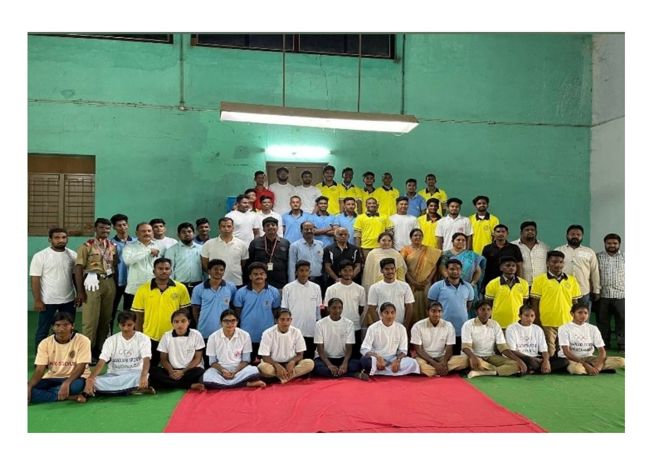
International yoga day celebrations In association with NCC, Department of Physical Education and NSS Units