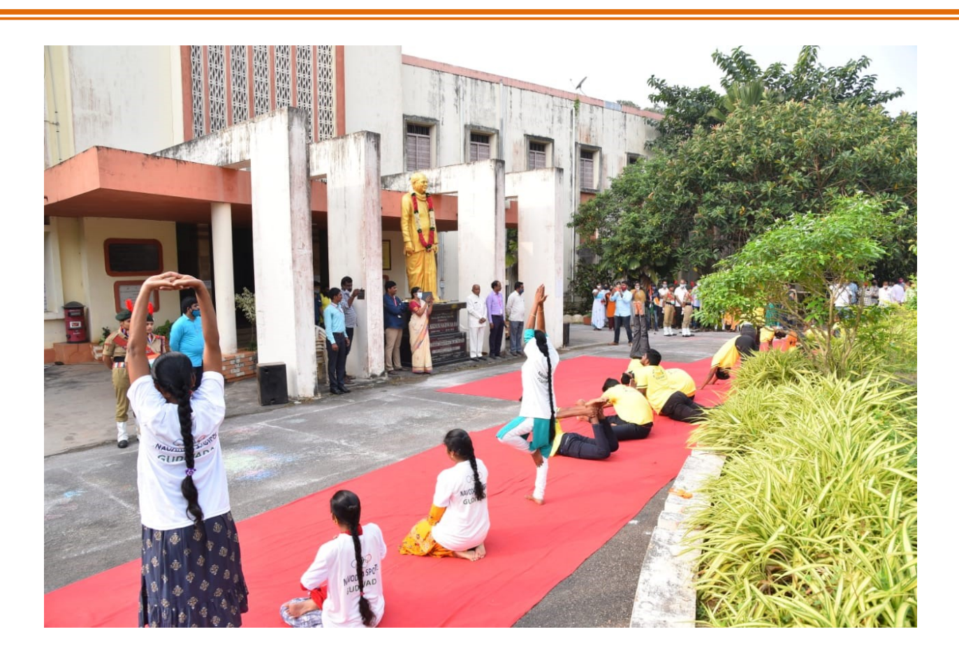
INTERNATIONAL YOGA DAY CELEBRATIONS